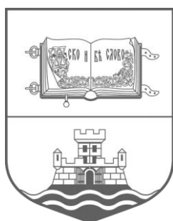
University of Belgrade